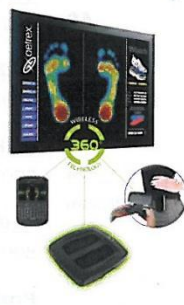
iStep Wave Foot Scanning

Eastern Podiatry Laboratories 800/327-8763