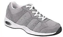
Slip-Resistant Athletic Shoes

KeepingPace 978/526-0020 www.keepingpace.com