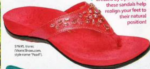
Created by a podiatrist, these sandals help realign your feet to their natural position!

There's no need to sacrifice comfort for style: From ultra-padded insoles to customizable arch support, each of these pretty pairs of shoes has a feel-good secret!