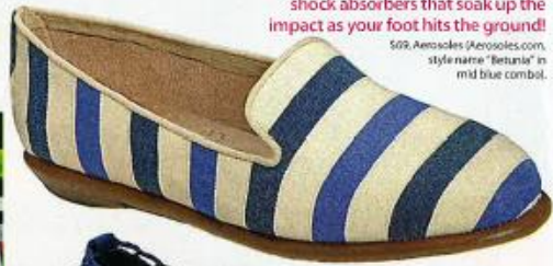
Diamond cutouts in the sole act as tiny shock absorbers that soak up the impact as your foot hits the ground!