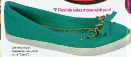
Flexible soles move with you!