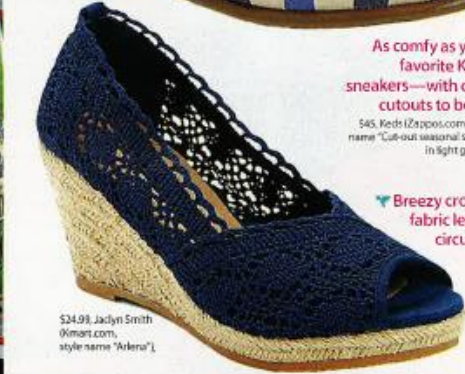
As comfy as your favorite Keds sneakers—with cute cutouts to boot!